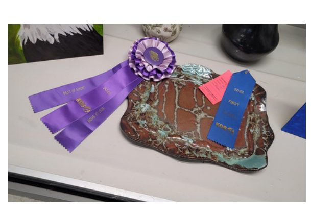
Nancy Baldwin (Pottery): Best of Show + 1st Place